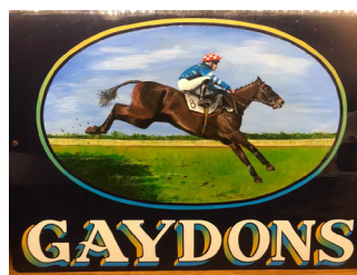
The hand painted sign created by Sheila Smith