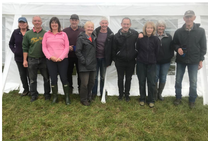
The big marquee took 12 people 3 hours to put this up!!